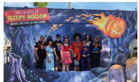
Guided Tour Travelers & staff dressed up for Halloween in Disney's Magic Kingdom

The full 12-page version of this Rates & Dates is available to download and print out from our website www.guidedtour.com . You can download and print out the registration form or register directly on our website for any Guided Tour vacation.