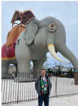
A Photo of a traveler in front of the iconic Lucy the Elephant during a Guided Tour Seashore Vacation

The Guided Tour – Proudly entering our 54th year of providing our travelers with life-changing experiences!