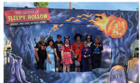
Guided Tour Travelers & staff dressed up for Halloween in Disney's Magic Kingdom

The full 12-page version of this Rates & Dates is available to download and print out from our website www.guidedtour.com . You can download and print out the registration form or register directly on our website for any Guided Tour vacation.