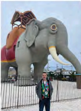
A Photo of a traveler in front of the iconic Lucy the Elephant during a Guided Tour Seashore Vacation

The Guided Tour – Proudly entering our 54th year of providing our travelers with life-changing experiences!