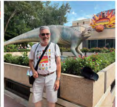
A Guided Tour traveler in front of a dinosaur at Universal's Island of Adventure