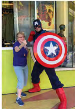
A traveler getting Star-spangled vibes with the legend himself – Captain America – in Universal, Orlando