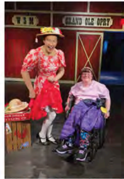
A Guided Tour traveler pictured with 'Minnie Pearl' at the legendary GRAND OLE OPRY