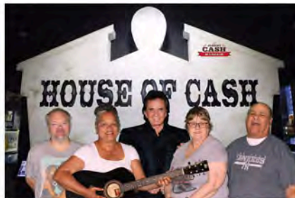
Travelers and staff visiting 'Johnny Cash' in Nashville, TN