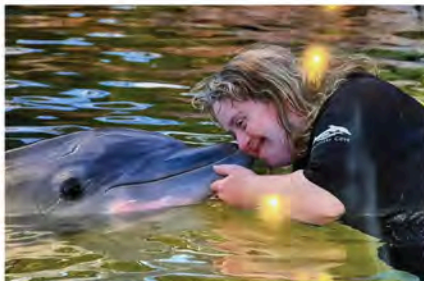
A Guided Tour traveler getting kissed by a dolphin at Orlando's Discovery Cove