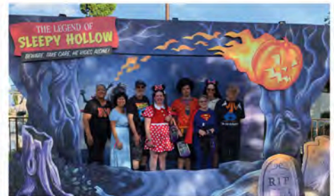
Guided Tour Travelers & staff dressed up for Halloween in Disney's Magic Kingdom

The full 12-page version of this Rates & Dates is available to download and print out from our website www.guidedtour.com . You can download and print out the registration form or register directly on our website for any Guided Tour vacation.