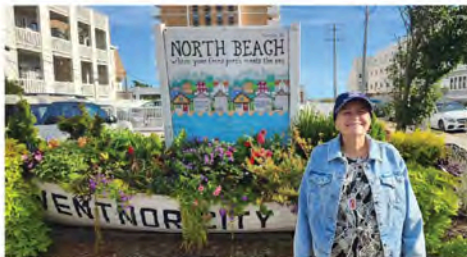
A traveler enjoying the beautiful surroundings while walking to the boardwalk located one block from The Guided Tour's Seashore Program